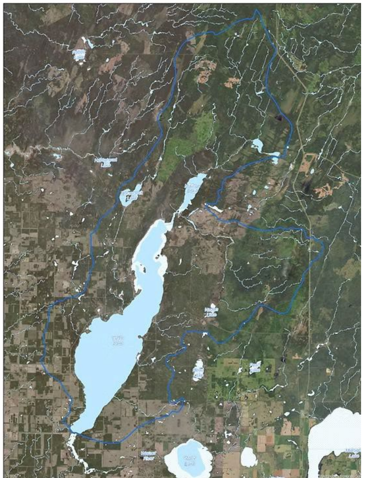
Turtle Lake Basin